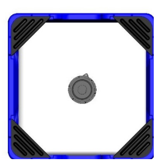
APL 1000 Plan view