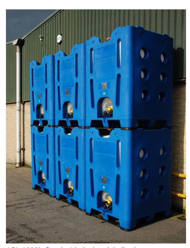
APL 1000's fitted with dry break ball valves